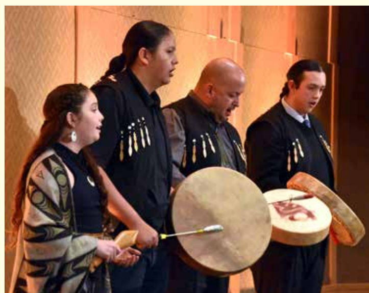
The Bill Family provided a cultural performance.